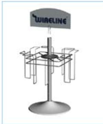
5. Insert sign holder.