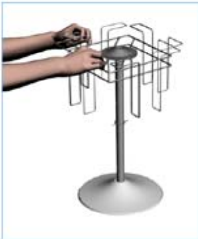
4. Place tier on washer.