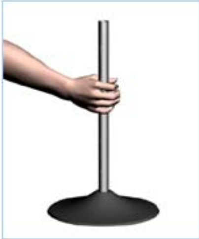
1. Insert the pole to the base